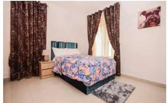
MASTER BEDROOM(ENSUITE) + KICTHEN